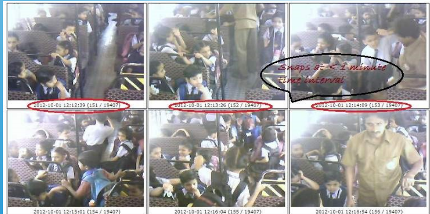
Camera Interface Available

Sifa Sanpra Sytems Pvt Ltd B-122, Rajratna Industrial Estate B.J. Patel Road, Malad (W) Mumbai, India – 400 064 Email : sales@sifa.com